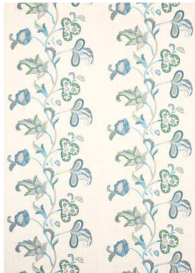
Cawdor BF10560/2 3 colours