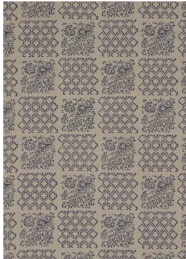
Carew BP10559/1 2 colours