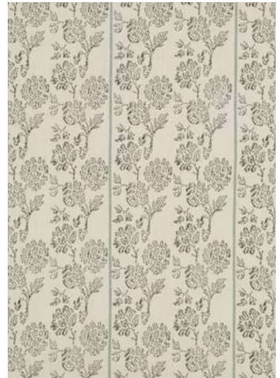
Zennor BP10555/3 4 colours