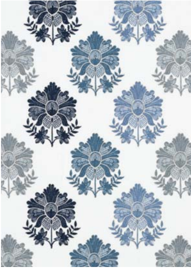
Tregony BF10562/1 4 colours