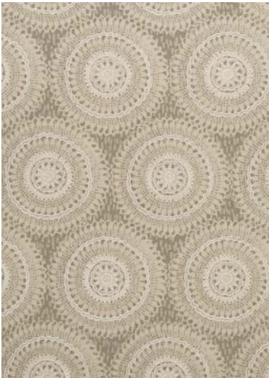
Cheriton BP10568/4 4 colours