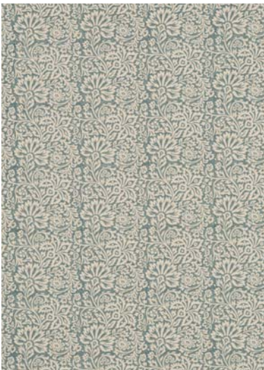
Flora BP10558/2 4 colours