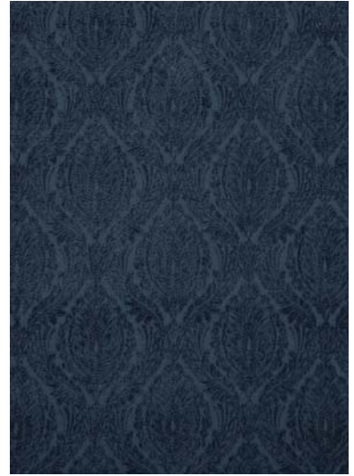
Pentire BF10569/680 5 colours