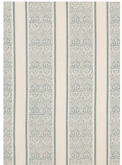
Polperro BP10556/2 4 colours